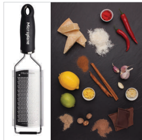
Gourmet Fine / Spice Grater 45004