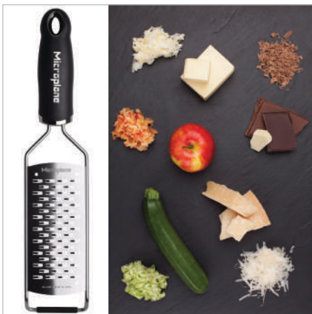
Gourmet Medium Ribbon 45002