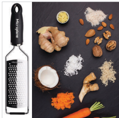
Gourmet Coarse Grater 45000

Microplane® is the premier brand worldwide for exceptionally sharp culinary tools. Possibly most famous for our graters and zesters, the brand has revolutionized the way chefs and home cooks grate and zest a wide range of ingredients for flavorful, gourmet style cooking and baking.