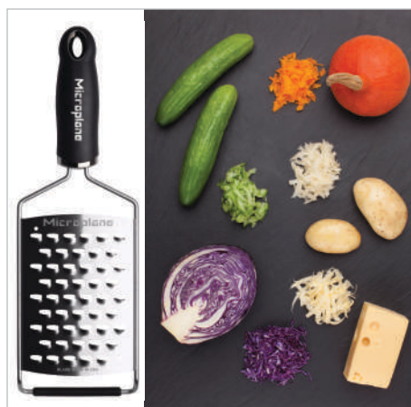
Gourmet Ultra Coarse Grater 45011