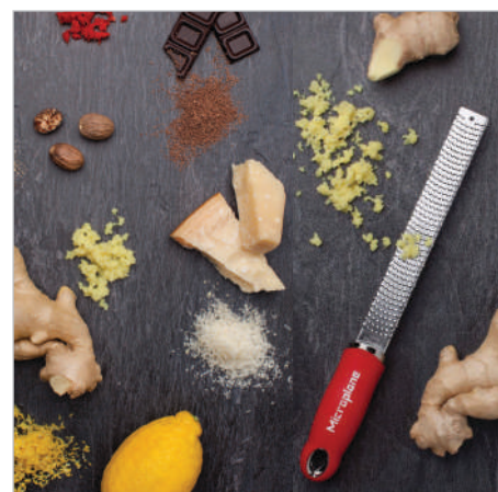
Zester Grater 46120