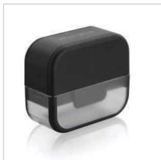
Garlic Mince & Slice Set 48048