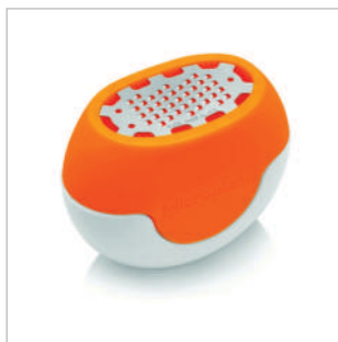
Flexi Zesti Orange 34830