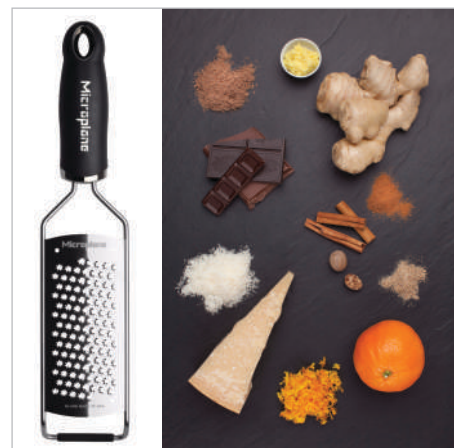
Gourmet Star Grater 45009