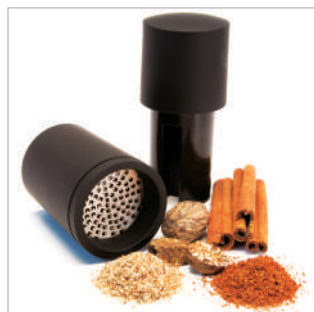
Spice Mill Black 48060