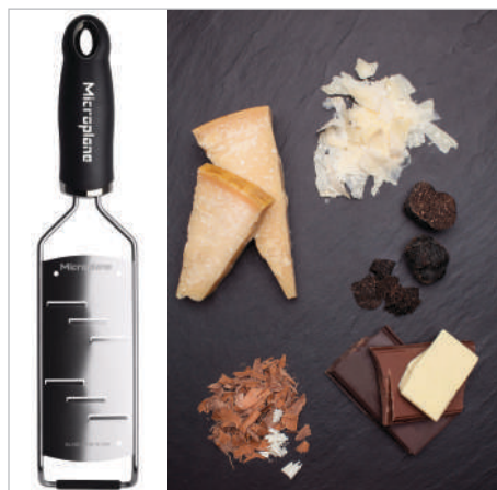
Gourmet Large Shaver 45006