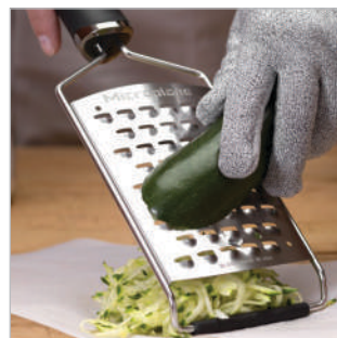
Cut Resistant Glove 34007