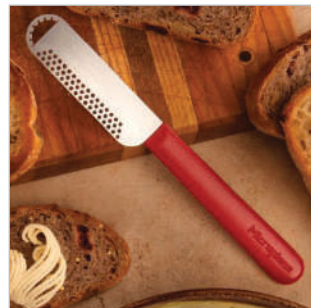
Butter Blade 41151