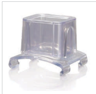
Gourmet Slider Attachment 45057