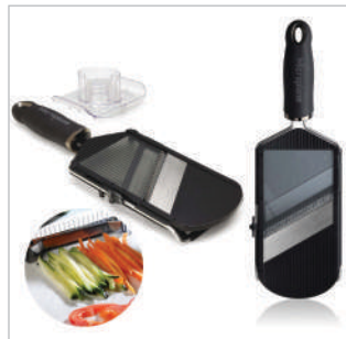
Adjustable Slicer with Julienne Blade 34040