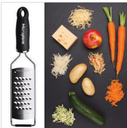
Gourmet Extra Coarse Grater 45008